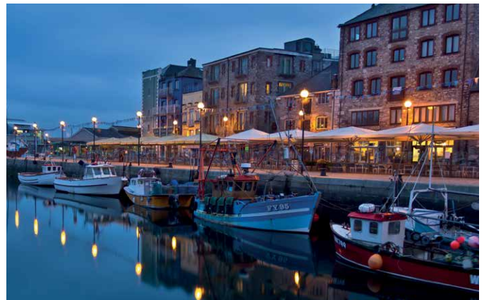
(Above)The Barbican. (Far Left) Smeaton's Tower

You can even navigate the city by boat – unsurprisingly, as Britain's Ocean City, one of the best ways to appreciate this wonderful place is on the water.