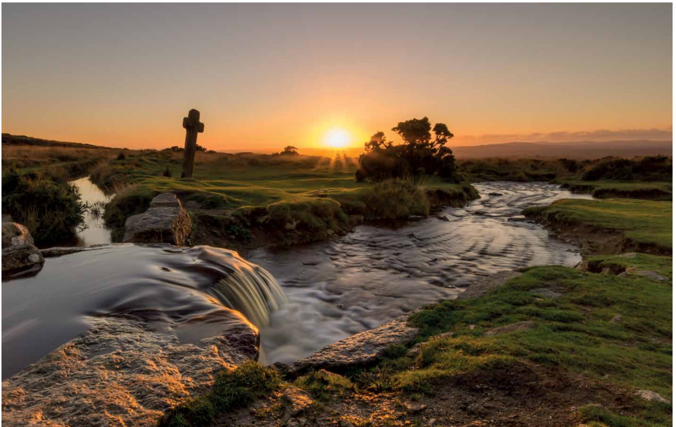
Sunset on Dartmoor