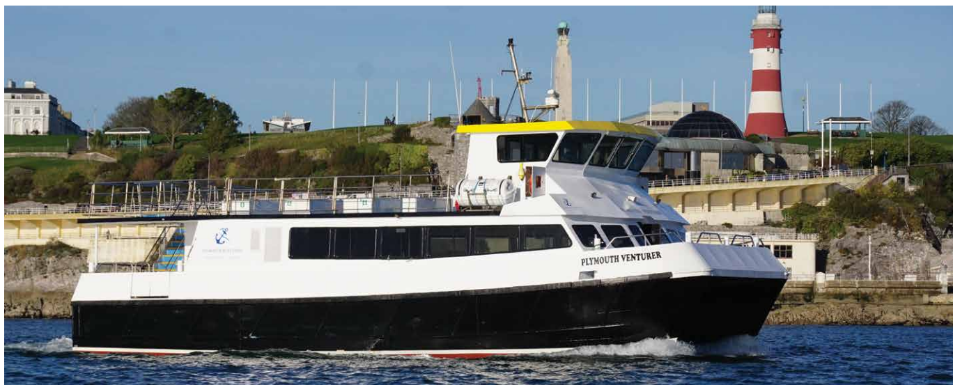
Plymouth Boat Trips

To book please visit www.plymouthboattrips.co.uk